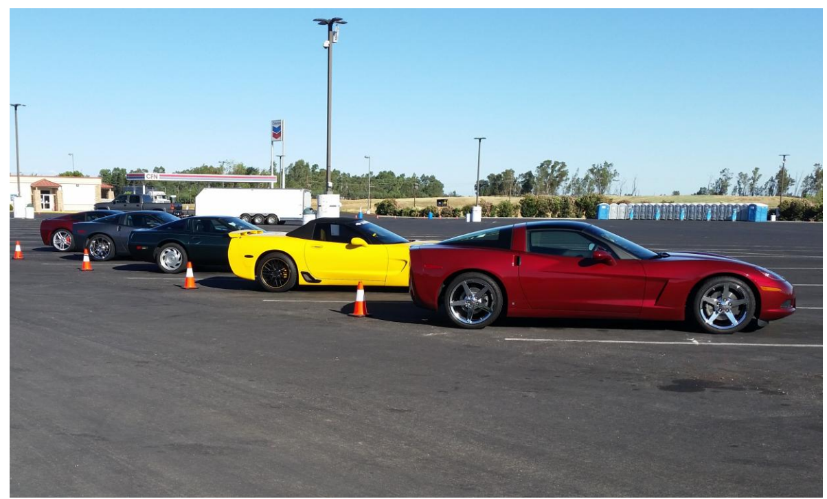
Preferred parking at Corning Ribs & Rods