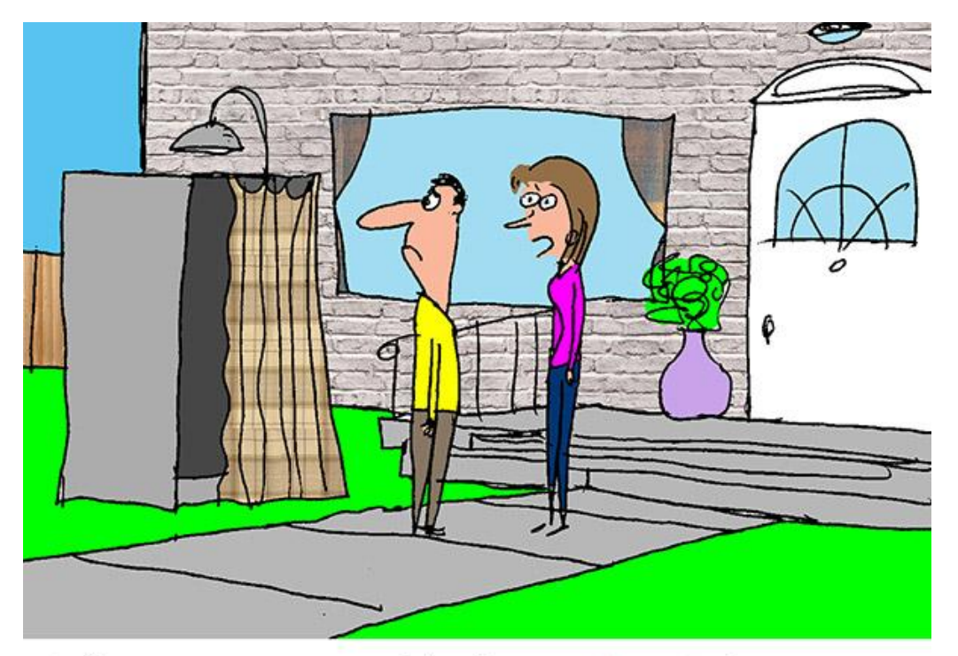
"If you want to ride in my new Corvette, you'll need to shower first. I set up an outdoor shower for your convenience."